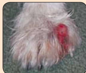
Paw of a dog with an interdigital cyst caused by a grass seed