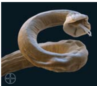
The dog Lung Worm

Its important to keep up to date with parasites that can affect your pets. With climate changes and an increase in animal movement across the world more and more are appearing to become potential threats to your pets.