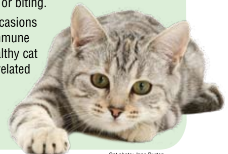
Cat photo: Jane Burton

The good news is that there is a very effective vaccine, giving cats protection against this deadly disease. Please contact us for further information or an appointment.